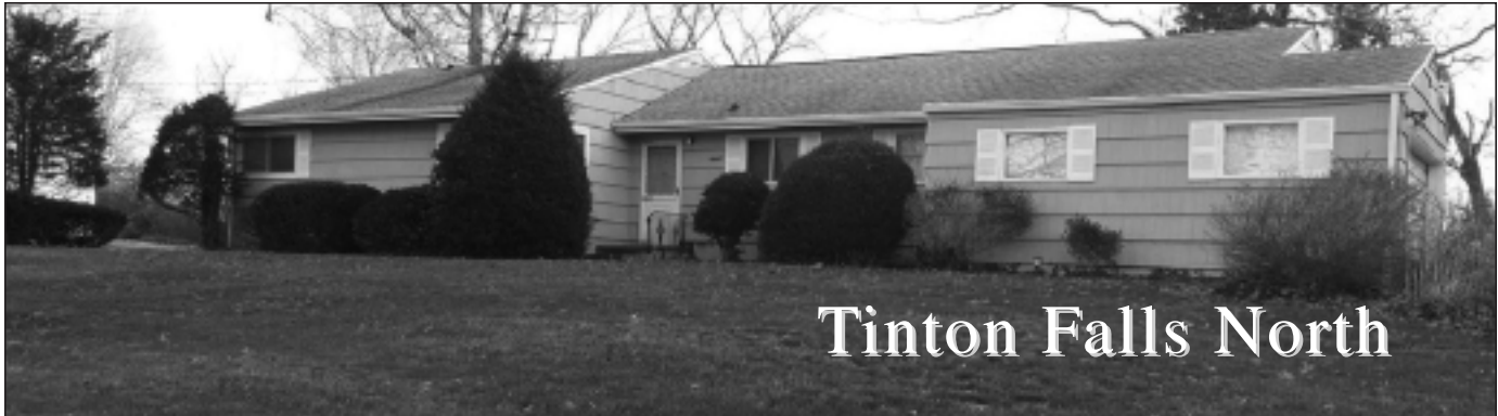
Tinton Falls North

P urchased in May, AMIB's 13th group home is located in the Shrewsbury section of Tinton Falls North , near Routes 18 and 35 and off the Garden State Parkway. This 2,600-square-foot single family residence sits on six tenths of an acre. Although there are no sidewalks, the tree-lined development is tucked away from major traffic throughways and has plenty of wide streets for leisurely strolls. AMIB intends to keep the footprint but completely gut the interior. We will rearrange the living space to meet the accessibility needs of future residents. The new residence will include four bedrooms, two bathrooms, a laundry room, nurse/medication station, living room, dining room, kitchen and administrative office. Ramping will also be added to the front and rear of the building. Stores and recreational facilities for future residents are available in nearby Red Bank and Eatontown; and medical facilities are located nearby at the Monmouth Medical Center and the Meridian Nursing/Rehabilitation Shrewsbury Center.